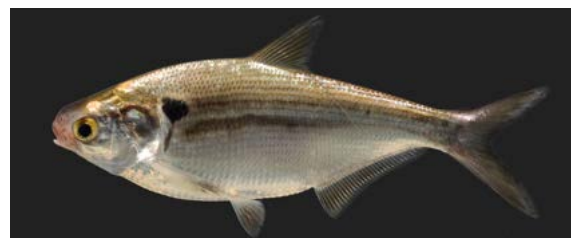
(3) Gizzard Shad

Family: Lampreys Ohio Status: None Size: 6-7" Observation: Visual/Nets Kokosing Abundance: Rare Access Points: All