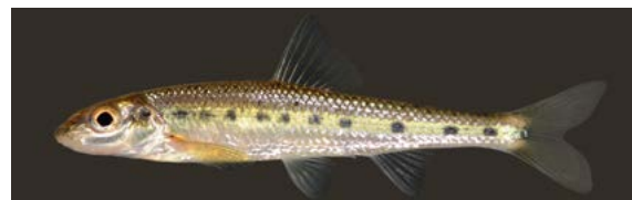
(7) Streamline Chub

Family: Minnows & Carps Ohio Status: None Size: 7-9", max. 12.5" Observation: Hook & Line Kokosing Abundance: Common Access Points: All