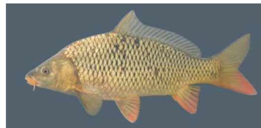
(4) Common Carp

Family: Shad & Herrings Ohio Status: None Size: 12-16", max. 20" Observation: Visual/Nets Kokosing Abundance: Moderate Access Points: PR, MW, ZR, RC