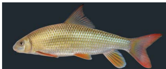
(21) Black Redhorse

Family: Suckers Ohio Status: None Size: 12-15", max. 20", 1-3lbs Observation: Hook & Line Kokosing Abundance: Common Access Points: All