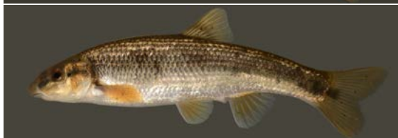
(17) Central Stoneroller Minnow

Family: Suckers Ohio Status: None Size: 18-24", max. 30", 4-10lbs Observation: Hook & Line Kokosing Abundance: Common Access Points: All