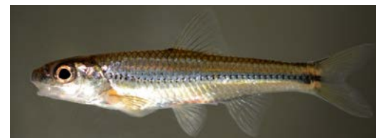
(8) Bigeye Chub

Family: Minnows & Carps Ohio Status: None Size: 3-4", max. 4.5" Observation: Visual/Nets Kokosing Abundance: Common Access Points: LG, LR, BR, PR, MW, ZR, RC