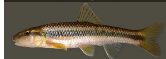
(6) River Chub

Family: Minnows & Carps Ohio Status: None Size: 7-9", max. 12.5" Observation: Hook & Line Kokosing Abundance: Common Access Points: All