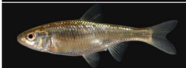
(9) Striped Shiner

Family: Minnows & Carps Ohio Status: None Size: 4-7", max. 9.3" Observation: Hook & Line Kokosing Abundance: Common Access Points: All