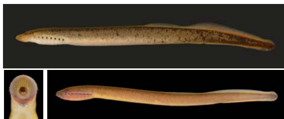
(1) Mountain Brook Lamprey

Family: Lampreys Ohio Status: Endangered Size: 6-7" Observation: Visual/Nets Kokosing Abundance: Rare Access Points: LG, LR, BR, PR, MW, ZR, RC