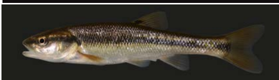
(5) Creek Chub

Family: Minnows & Carps Ohio Status: None Size: 6-8", max. 11.9" Observation: Hook & Line Kokosing Abundance: Moderate Access Points: RP, MP, LG, LR, BR