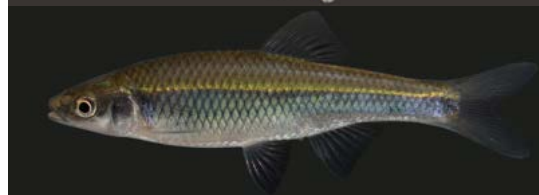
(10) Spotfin Shiner

Family: Minnows & Carps Ohio Status: None Size: 2-4", max. 4.8" Observation: Visual/Nets Kokosing Abundance: Common Access Points: All