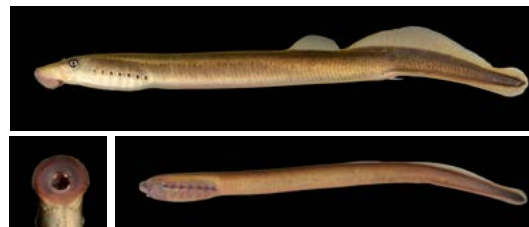
(2) Least Brook Lamprey

Family: Lampreys Ohio Status: Endangered Size: 6-7" Observation: Visual/Nets Kokosing Abundance: Rare Access Points: LG, LR, BR, PR, MW, ZR, RC