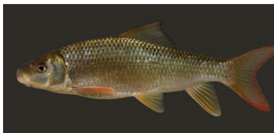
(22) Golden Redhorse

Family: Suckers Ohio Status: None Size: 20-26", max. 32" 6-12lbs Observation: Hook & Line Kokosing Abundance: Rare Access Points: MW, ZR, RC