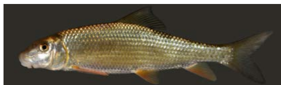
(19) Silver Redhorse

Family: Suckers Ohio Status: None Size: 10-15", max. 20", 1-3lbs Observation: Hook & Line Kokosing Abundance: Common Access Points: All