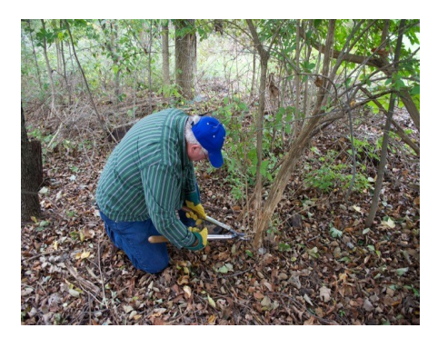
Pictured above is a volunteer removing Honeysucke at Wolf Run Park in 2015.

The Friends of the Woods volunteer group has not removed invasive honeysuckle in the past, although as more volunteers join in this fight, that might be possible. For now, our goal is to raise awareness and help the public understand that just because a plant looks and smells pretty, that doesn't mean it is something that benefits the parks or the greater natural environment.